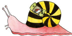
Illustration: Friederike Ablang, Berlin