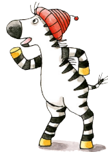
Illustration: Friederike Schumann, Berlin