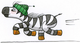
Illustration: Friederike Ablang, Berlin