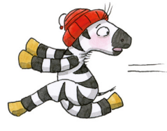
Illustration: Friederike Ablang, Berlin