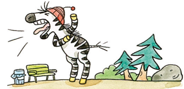
Illustration: Friederike Schumann, Berlin